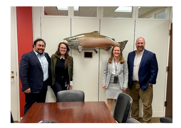
In the Denali Room, MXAK connected with hard

A high point of this venture was the rare privilege to explore the hallowed halls of the U.S. Capitol itself. In a moment that felt almost cinematic, Captain White, ventured into the inner sanctum of Senator Sullivan's hideaway office beneath the Capitol dome. Here, he expressed gratitude for our delegation's service and fostered discussions on continued collaboration to advance our vital mission.